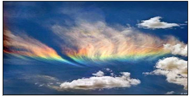
THIS IS A FIRE RAINBOW - THE RAREST OF ALL NATURALLY OCCURRING ATMOSPHERIC PHENOMENA.. THE PICTURE WAS CAPTURED IN AUGUST 2007 ON THE IDAHO/ WASHINGTON BORDER. THE EVENT LASTED ABOUT 1 HOUR. THE CLOUDS HAVE TO BE CIRRUS, AT LEAST 20K FEET IN THE AIR, WITH JUST THE RIGHT AMOUNT OF ICE CRYSTALS, AND THE SUN HAS TO HIT THE CLOUDS AT PRECISELY 58 DEGREES

Note that Camp Wendake policy with regard to documentation of your medical use of marijuana status remains in effect-- please refer again to your application form.